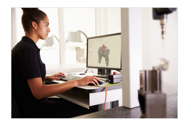
A Computer on Wheels: Hitachi Automotive Systems

Maintaining this digital thread enables you to view information in context, rapidly evaluate the impact of changes, enable compliance, and identify the root cause of problems in the field. Conversely, Digital Product Traceability makes it possible to look forward and determine what sort of impact a modification will have on a product down the road.